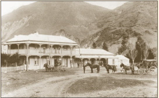
Rymers Coach, The Gentle Annie background

William Colenso gave us a word picture of the area, "...neither picturesque nor pleasing, being rather of a frightful kind, which is greatly augmented through the tawhai (nothofagus) forests which formerly covered several of the nooks and crests of the mountainous hills and cliffs, having been withered and destroyed. And the solitude... is intense and almost unbearable. In fact the whole of the country over which we had hitherto passed is of the utmost desolate description."