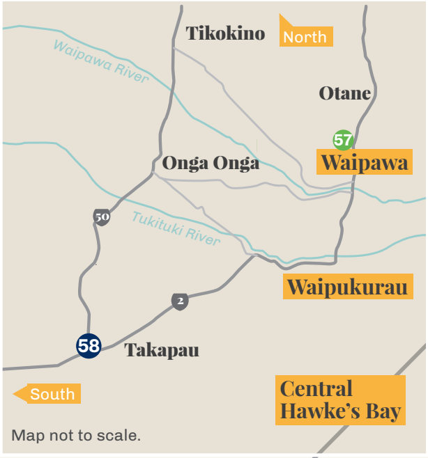
Map not to scale.

Some businesses may operate seasonal hours or by appointment only tastings, we recommend calling ahead of your visiting.