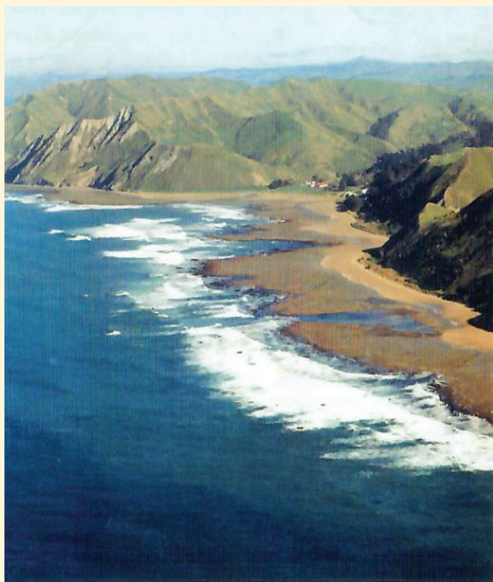
View of coast looking south over Te Angiangi Marine Reserve towards Blackhead.