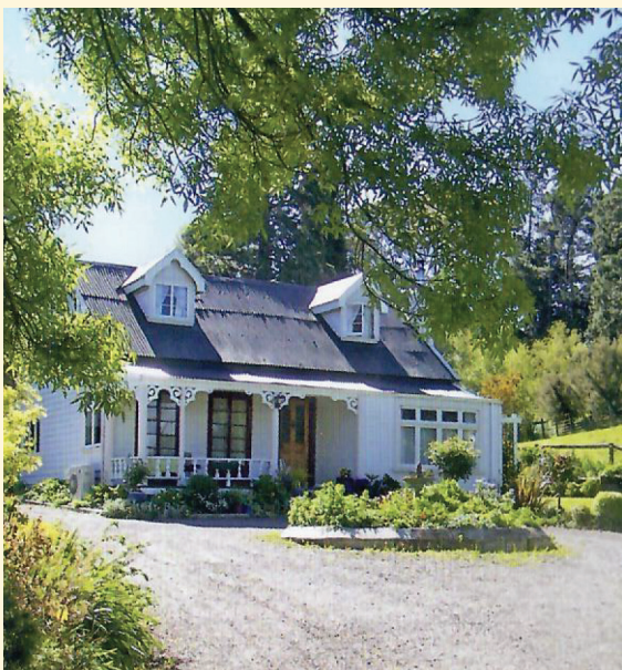
The Pines, oldest house in Waipawa c.1858.