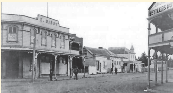
Second Bibby Store on site. Spire of Methodist Church. Moroney's Settlers Hotel (right), now the Commercial Hotel with top storey removed.