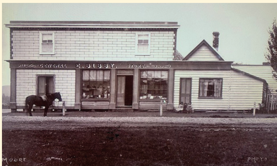
The first Bibby Store built 1862.

Bibby Store on corner of Ruataniwha Street Rose Garden.