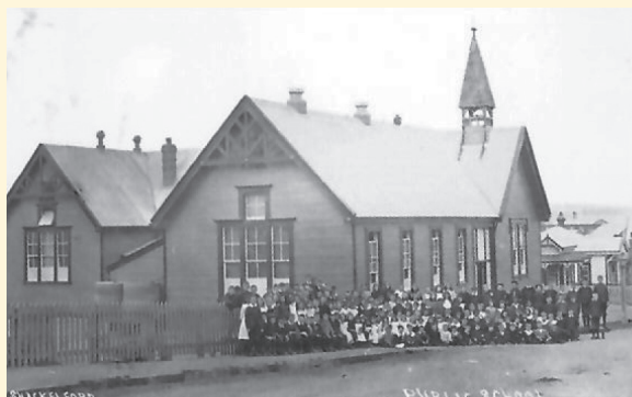
Waipawa Government School c.1907, cnr Kenilworth and Waverley Streets.