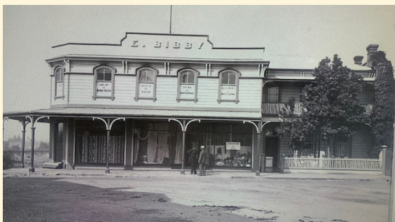
Second Bibby Store built 1882