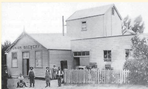
Union Brewery c.1898

2 Rose Street 'The Pines' is the oldest house in Waipawa, see cover photo and site plaque on grass verge. Look to the skyline for the notable trees planted by Dr Alex Todd.